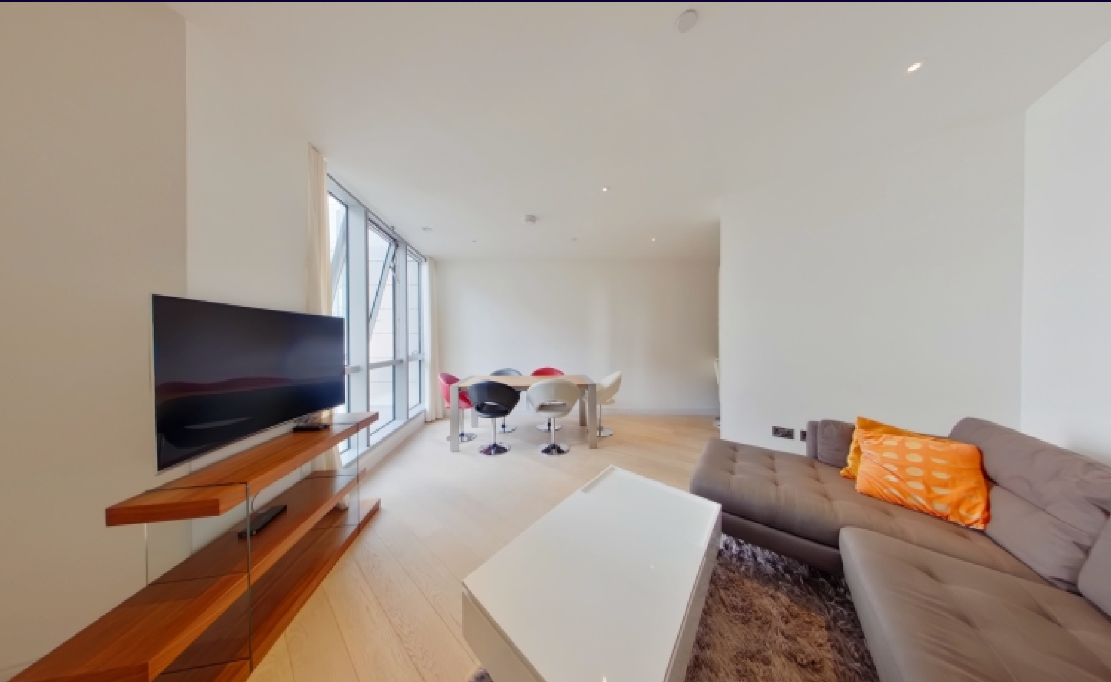
Charrington Tower, 11 Biscayne Avenue, London, E14