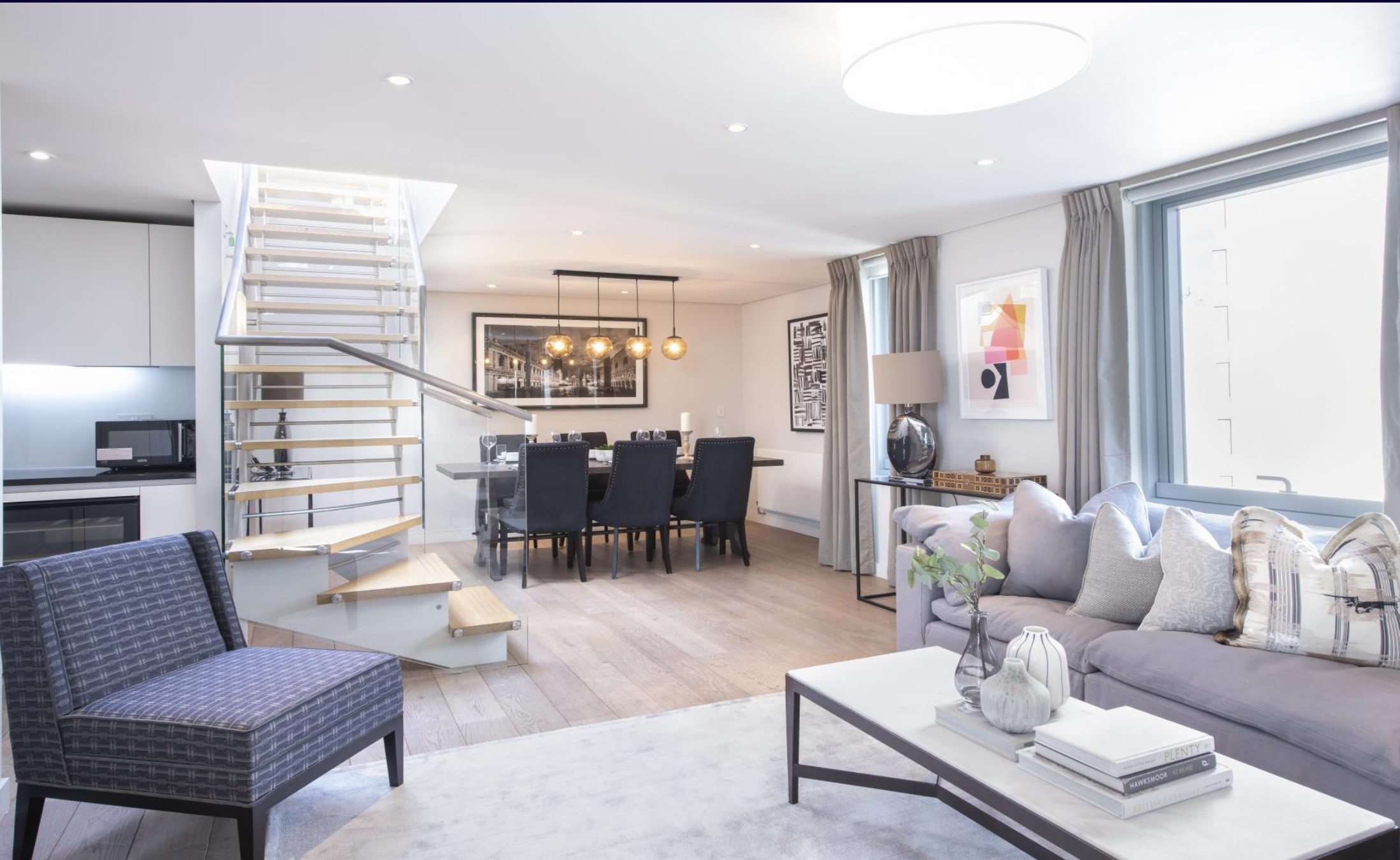
Merchant Square East, London, Greater London, W2 1AN