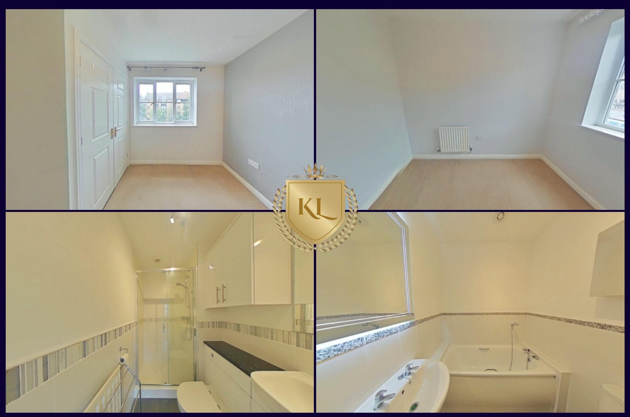
Kings Langley Estates wishes to inform prospective buyers and tenants that these particulars are a guide and act as information only. All our details are given in good faith and believed to be correct at the time of printing but they don't form part of an offer or contract. No employee of the company has authority to make or give and representation or warranty in relation to this property. All fixtures and fittings, whether fitted or not are deemed removable by the vendor unless stated otherwise and room sizes are measured between internal wall surfaces, including furnishings.