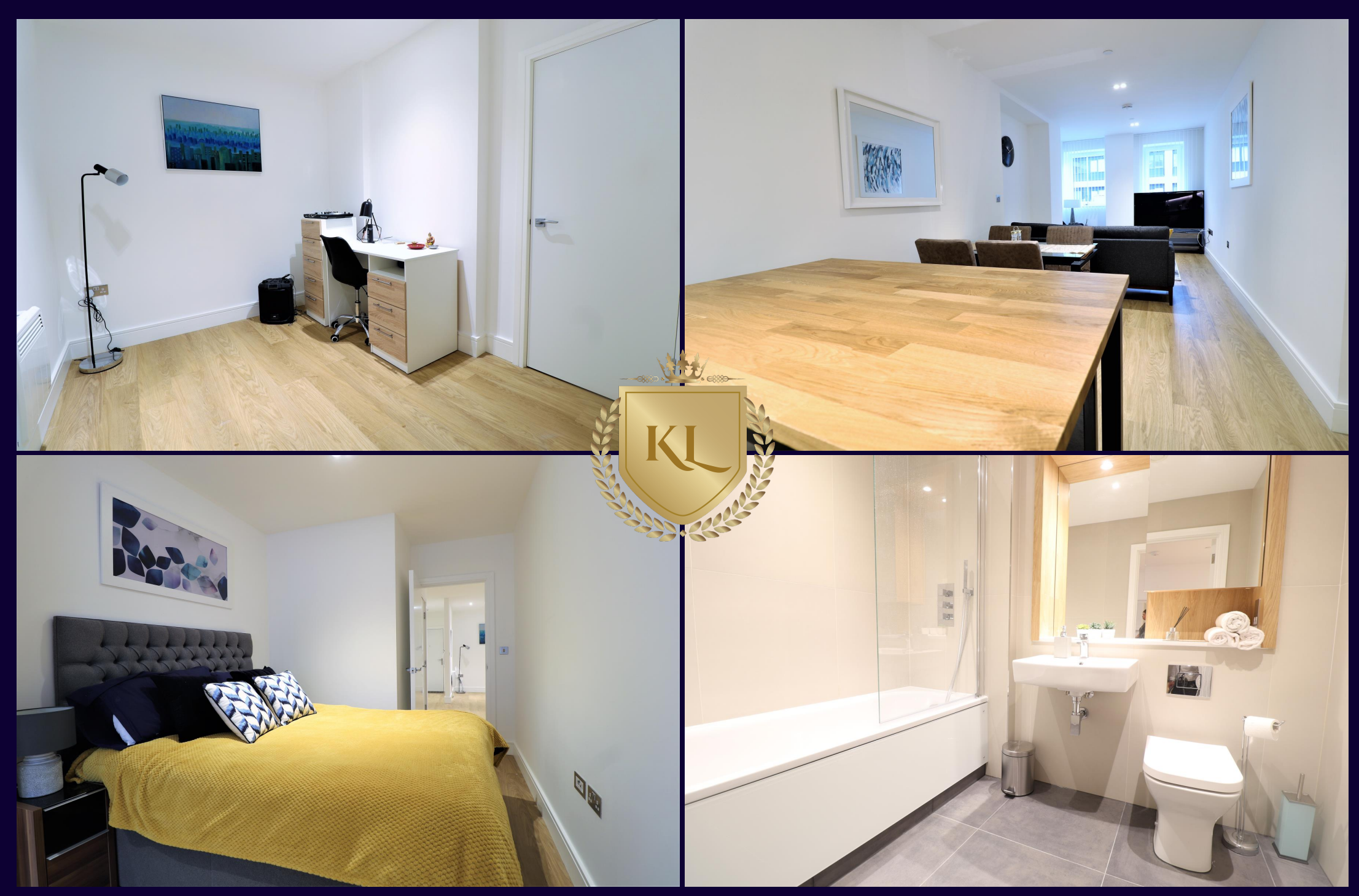
Kings Langley Estates wishes to inform prospective buyers and tenants that these particulars are a guide and act as information only. All our details are given in good faith and believed to be correct at the time of printing but they don't form part of an offer or contract. No employee of the company has authority to make or give and representation or warranty in relation to this property. All fixtures and fittings, whether fitted or not are deemed removable by the vendor unless stated otherwise and room sizes are measured between internal wall surfaces, including furnishings.