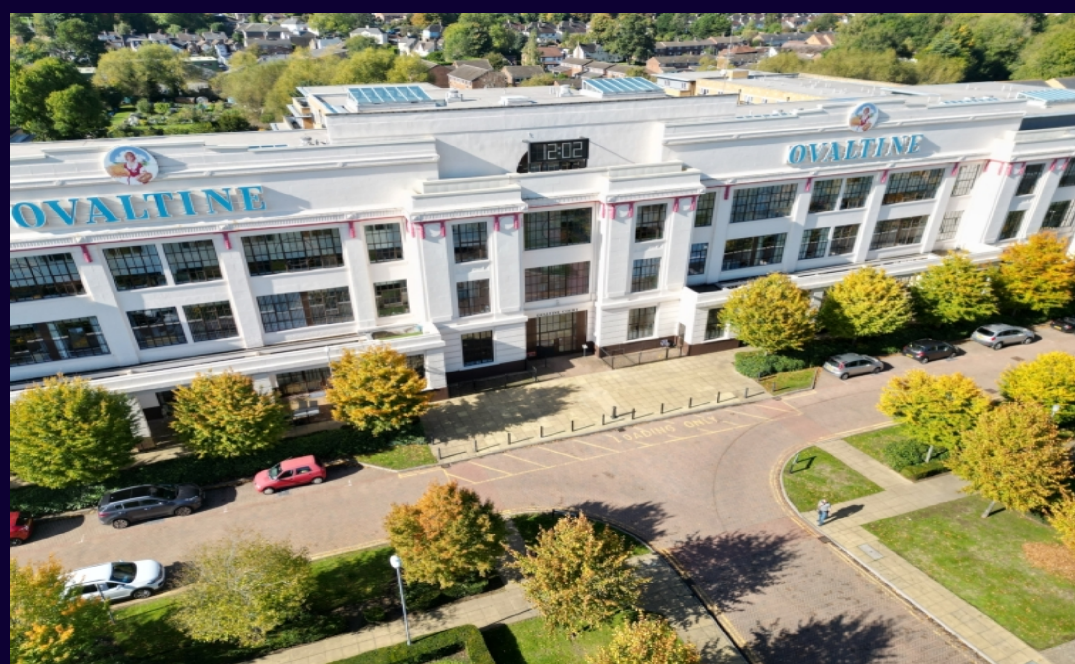
Ovaltine Court, Ovaltine Drive, Kings Langley, Hertfordshire, WD4 8GY