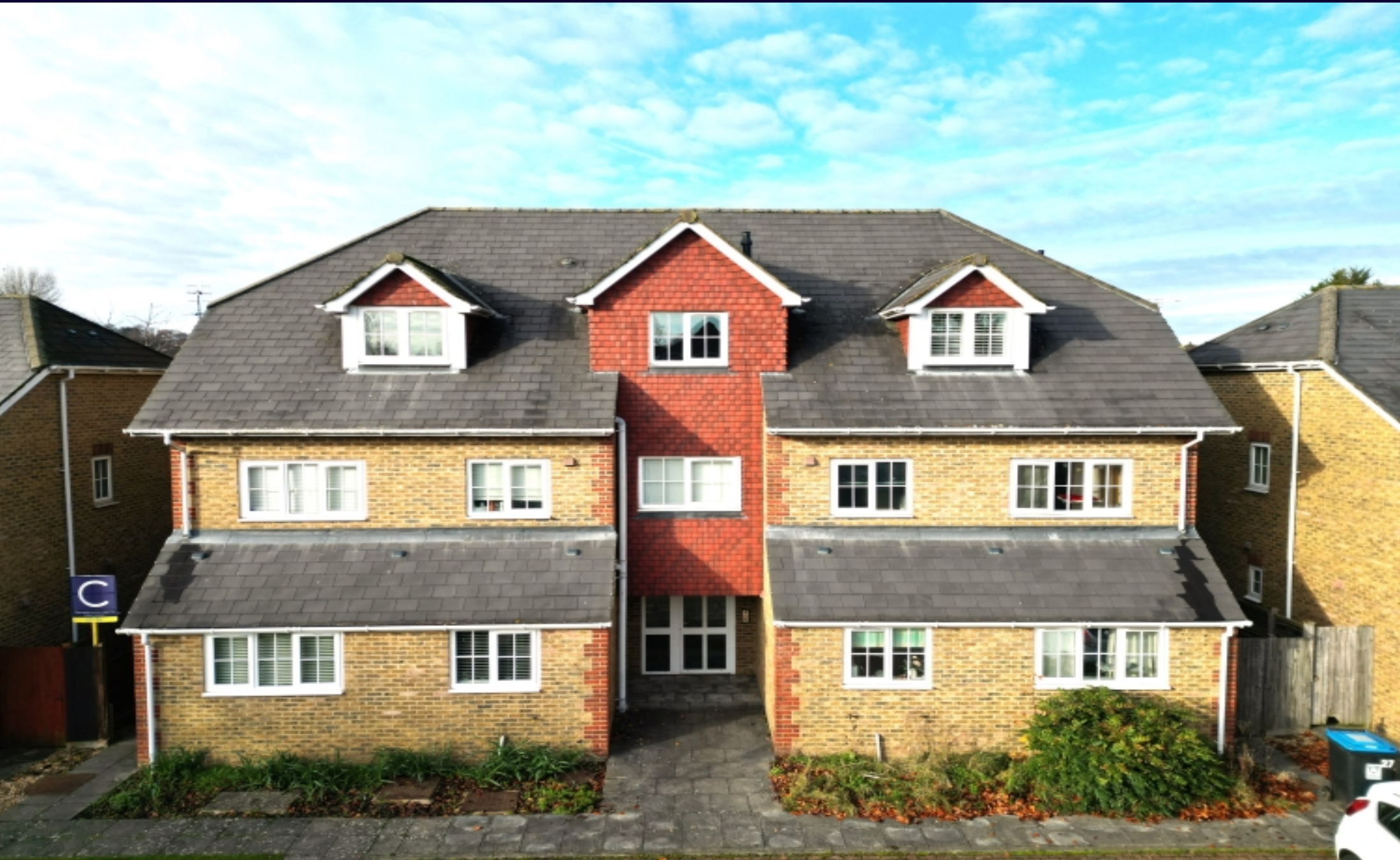
The Mallards, Hemel Hempstead, Hertfordshire, HP3 9DP