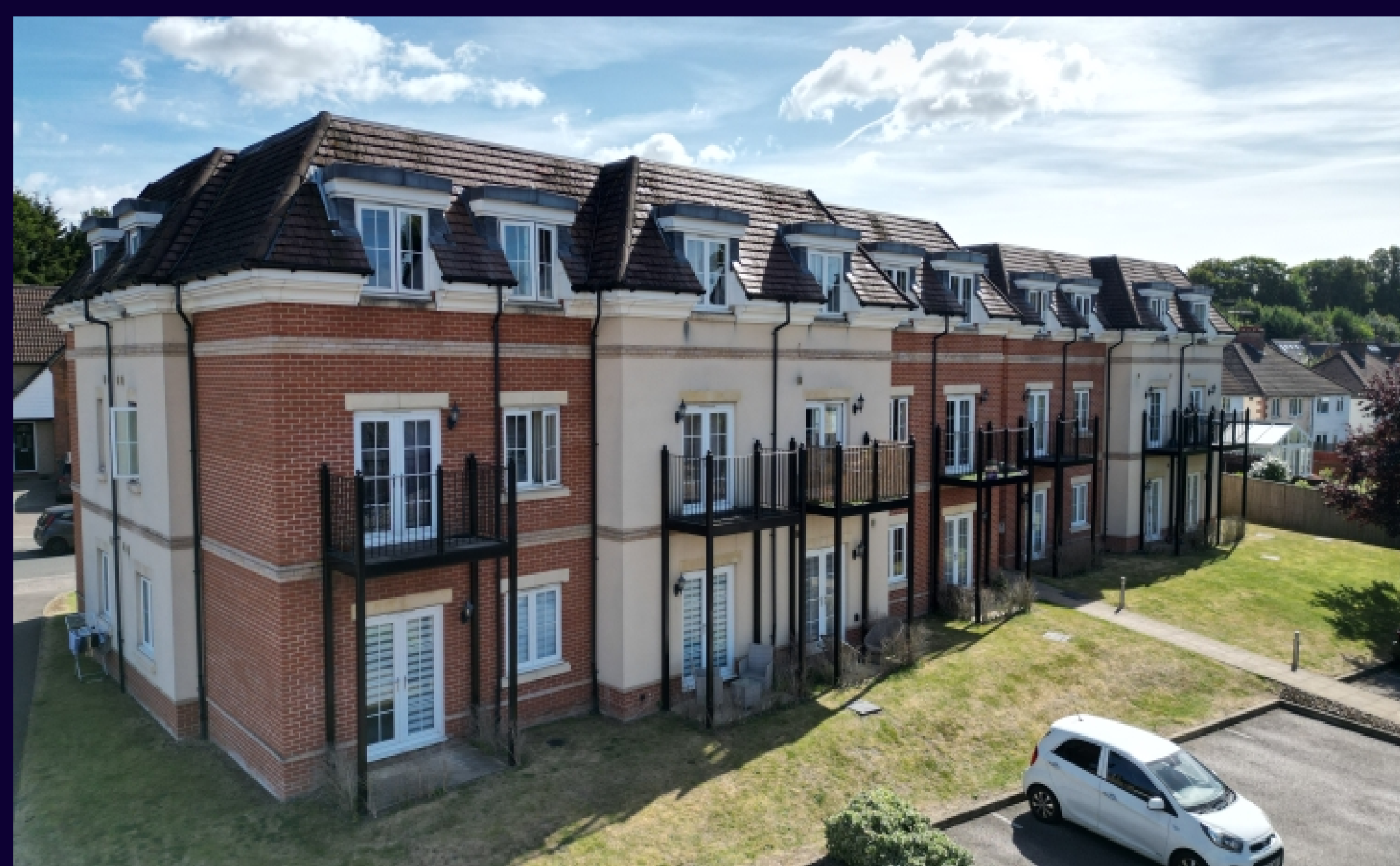
Navarre Court, 10 Primrose Hill, Kings Langley, Hertfordshire, WD4 8FS