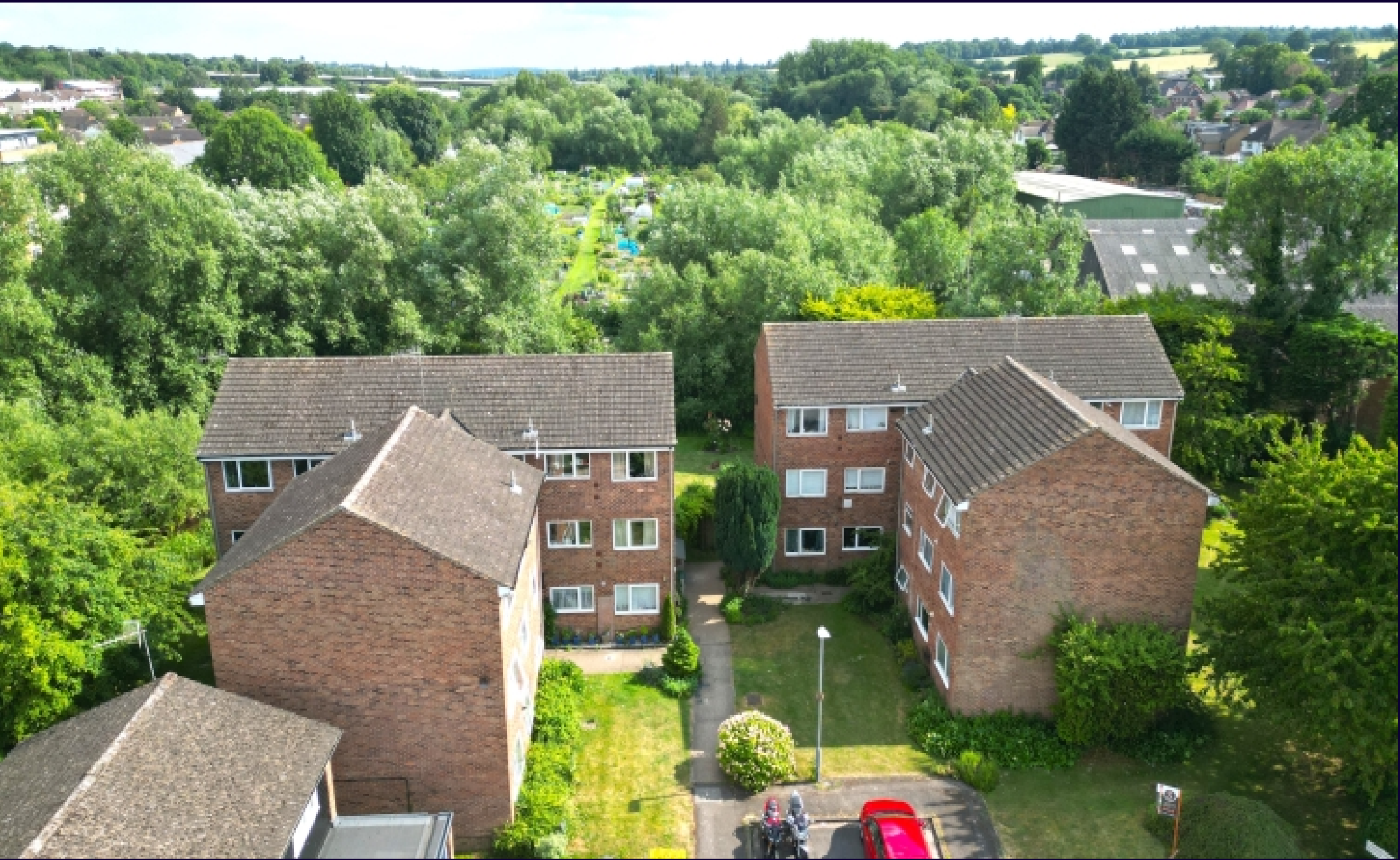
Riverside Close, Kings Langley, Hertfordshire, WD4 8HQ