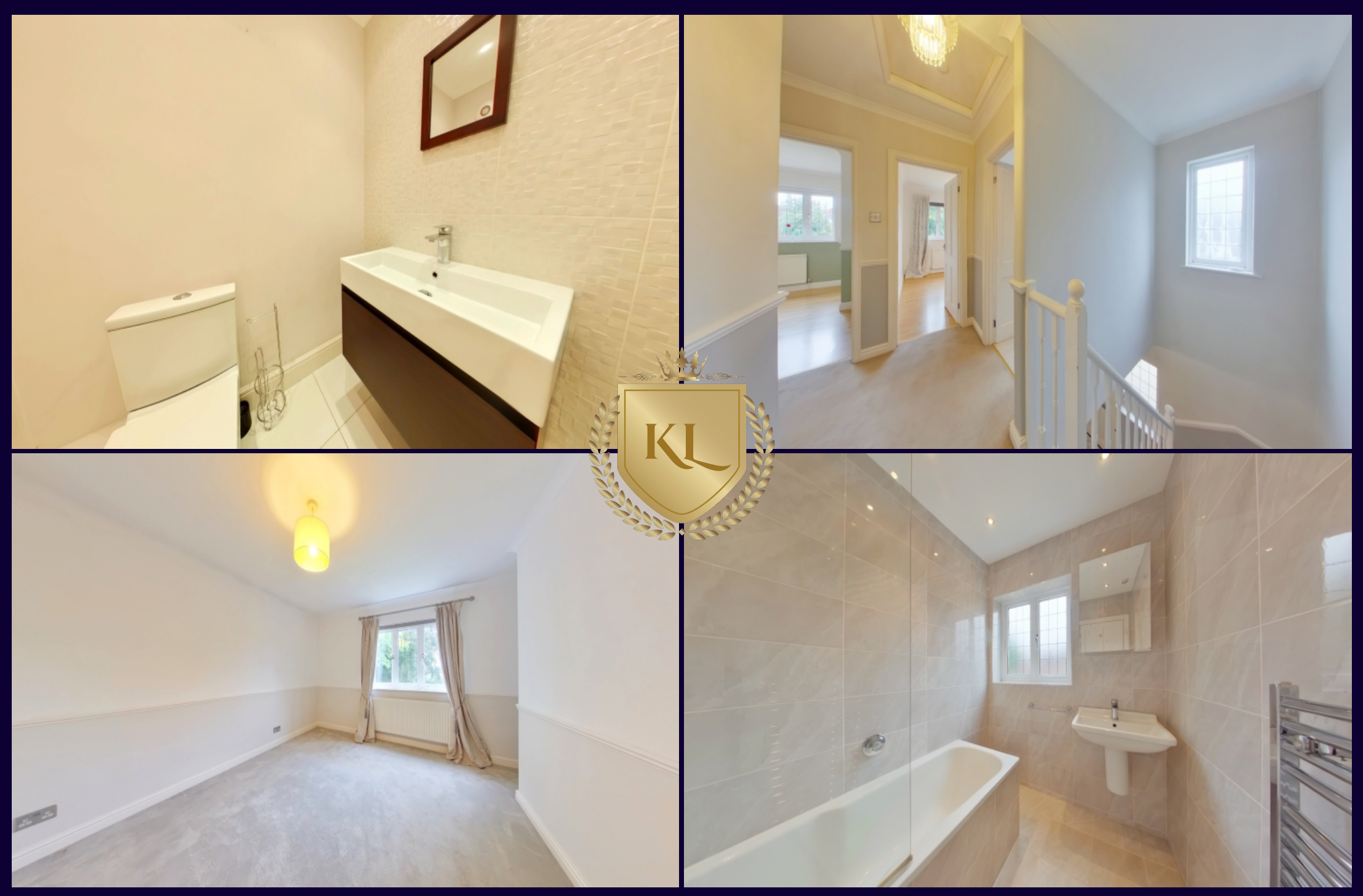
Kings Langley Estates wishes to inform prospective buyers and tenants that these particulars are a guide and act as information only. All our details are given in good faith and believed to be correct at the time of printing but they don't form part of an offer or contract. No employee of the company has authority to make or give and representation or warranty in relation to this property. All fixtures and fittings, whether fitted or not are deemed removable by the vendor unless stated otherwise and room sizes are measured between internal wall surfaces, including furnishings.