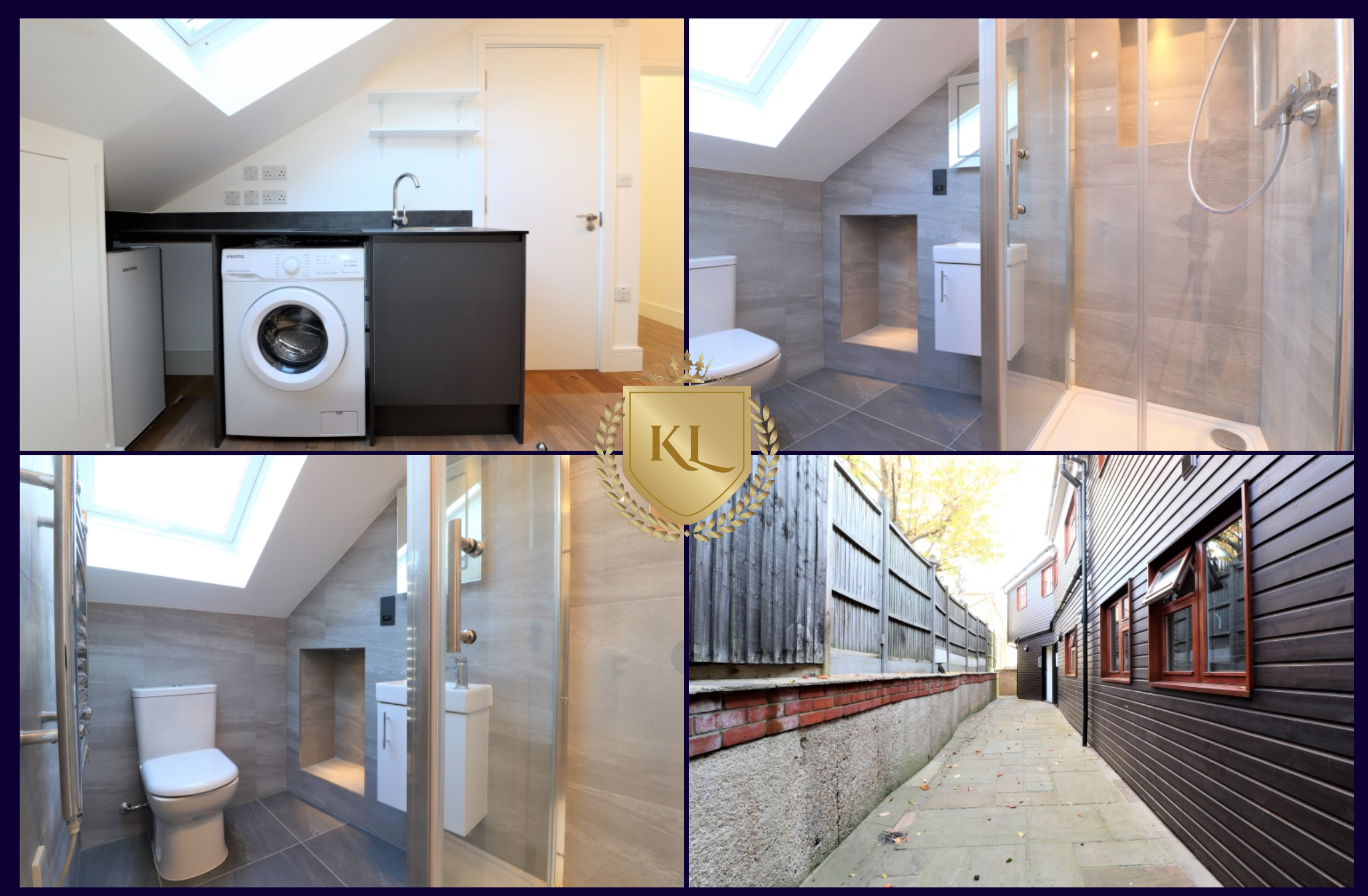
Kings Langley Estates wishes to inform prospective buyers and tenants that these particulars are a guide and act as information only. All our details are given in good faith and believed to be correct at the time of printing but they don't form part of an offer or contract. No employee of the company has authority to make or give and representation or warranty in relation to this property. All fixtures and fittings, whether fitted or not are deemed removable by the vendor unless stated otherwise and room sizes are measured between internal wall surfaces, including furnishings.