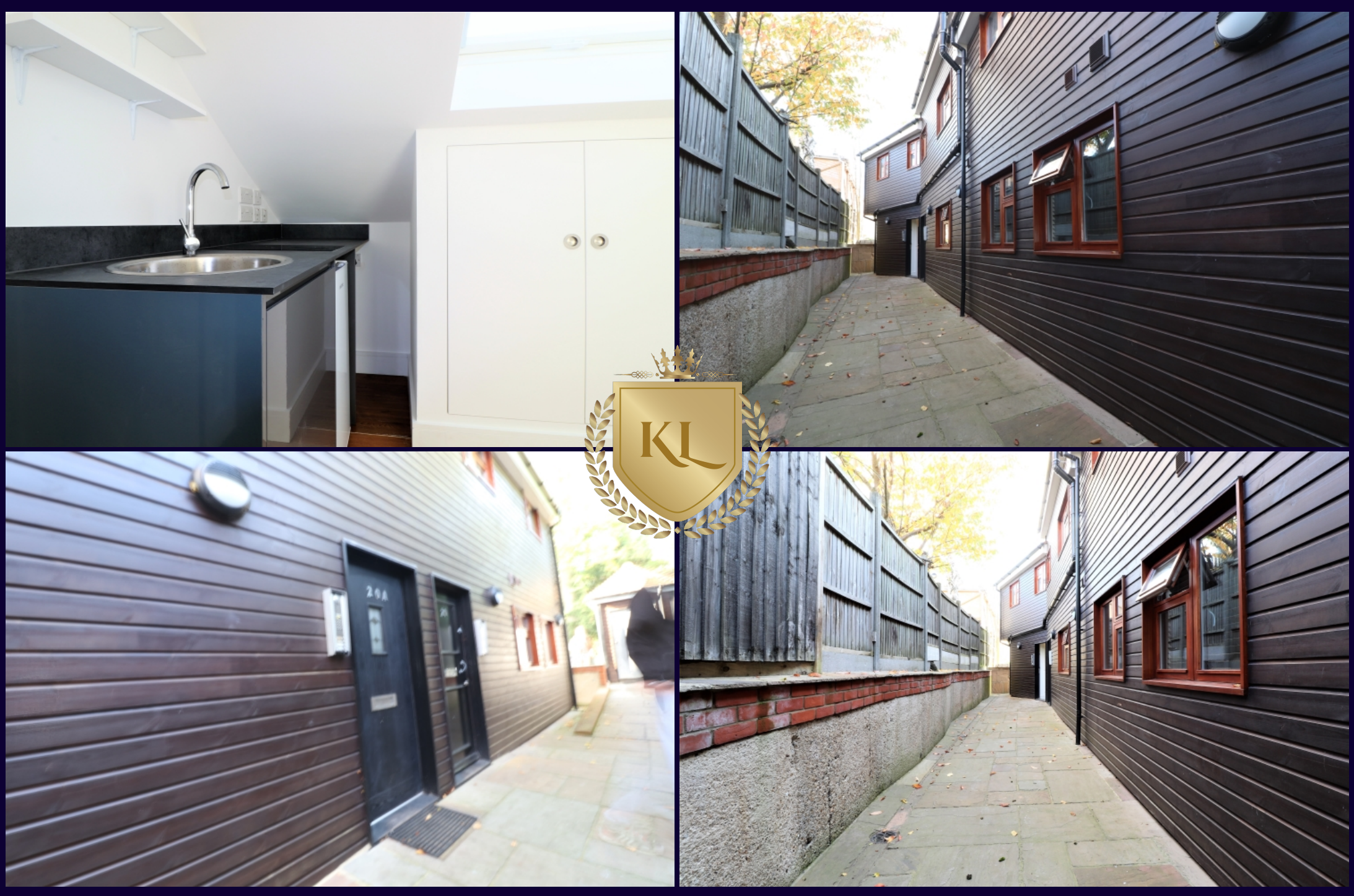
Kings Langley Estates wishes to inform prospective buyers and tenants that these particulars are a guide and act as information only. All our details are given in good faith and believed to be correct at the time of printing but they don't form part of an offer or contract. No employee of the company has authority to make or give and representation or warranty in relation to this property. All fixtures and fittings, whether fitted or not are deemed removable by the vendor unless stated otherwise and room sizes are measured between internal wall surfaces, including furnishings.